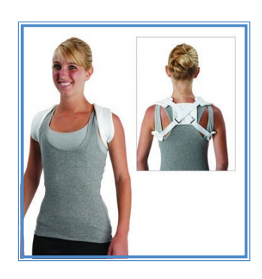
Figure 8 Clavicle Splint

· Prong buckle closure ensures correct fit without slippage